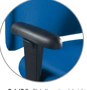
ErgoGel (OJ): Global's optional height adjustable, kidney shaped conforming gel armrests offer high shock absorption, and years of durable use. Armrests support and help reduce neck and shoulder strain.

"All backrests should provide adequate lumbar support and buttocks clearance. For tasks requiring upper body mobility, the backrest should provide adequate back support, but not interfere with the user's movement (typically these backs should not be higher than the bottom of the user's shoulder blades). For users who prefer reclining postures, or more upper back support, the back height should provide support for the shoulder blades".